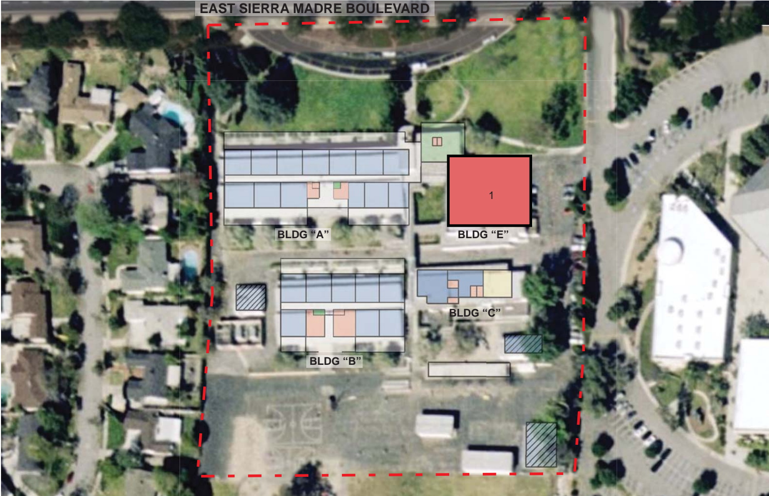
SITE SIZE : 6.80 ACRES