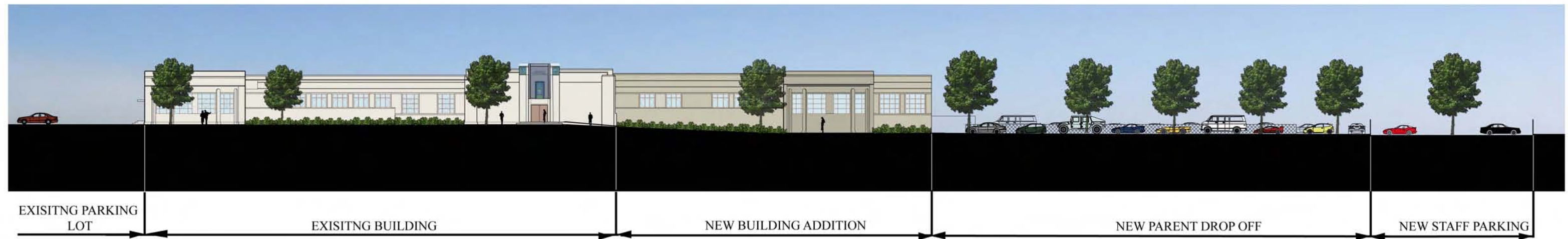
NORTH ELEVATION (PALISADE STREET)